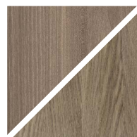
ASH C20 / OAK C20 Grey brown oiled

We treated this wood with our 'Grey brown oil'.