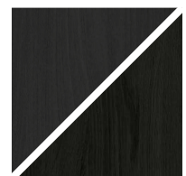
ASH C44 / OAK C44 Black matt lacquered

We treated this wood with our 'Grey brown oil'.