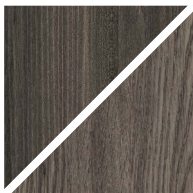
ASH C11 / OAK C11 Dark grey oiled

We treated this wood with our 'Black oil'.