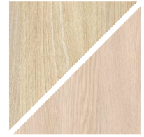
ASH C8 / OAK C8 Soaped

We treated this wood with our 'White oil'.