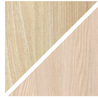
ASH C6 / OAK C6 White oiled

We treated this wood with our 'Natural oil'.