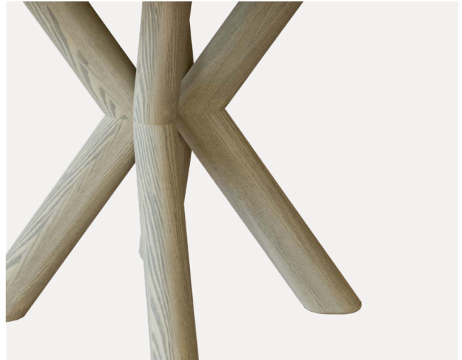
MUHLE dining table with edge profile 3 - Pisa (rounded).