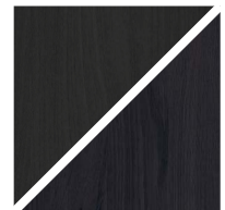
ASH C14 / OAK C14 Black stained & oiled

We treated this wood with our 'Light grey oil'.