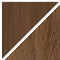
ASH C12 / OAK C12 Antique brown oiled

We treated this wood with our 'Black oil'.