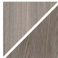
ASH C13 / OAK C13 Light grey oiled

We treated this wood with our 'Antique brown oil'.