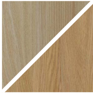
ASH C3 / OAK C3 Lacquered

We therefore recommend using the wood samples/exhibition furniture to get a more accurate impression.