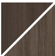
ASH C15 / OAK C15 Mocca brown oiled

C14 is for legs and storage furniture only!