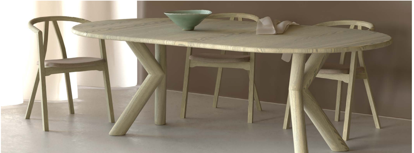
MUHLE dining table with two leaves and edge profile 8 - round.