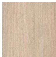
ASH C16 Warm white oiled

We treated this wood with our 'Mocca brown oil'.